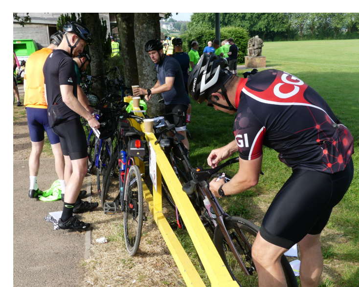
Riders getting ready at the start of the 101km route of the 2023