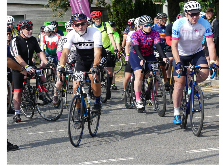
Riders leaving Caerleon at the start of the 101km route of the 2023