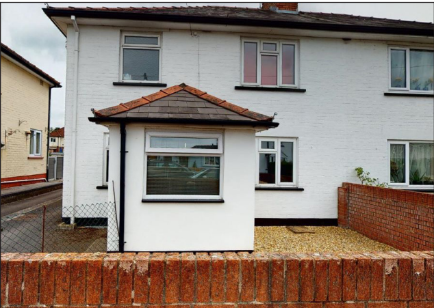
A three-bedroom, semi-detached house at 17 Llwynu Road, Abergavenny, attracted three bids when it was listed for £190,000. It eventually sold for £210,000.