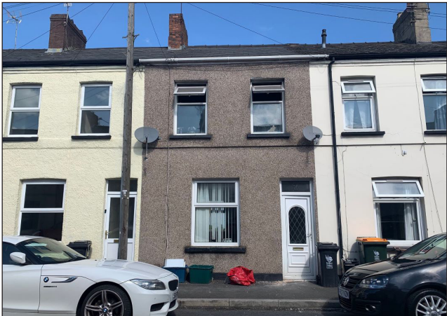
A three-bedroom, mid-terrace house at 7 Bristol Street, Maindee, Newport, which was listed with a guide price of £72,000 sold for £107,500 after attracting 65 bids.