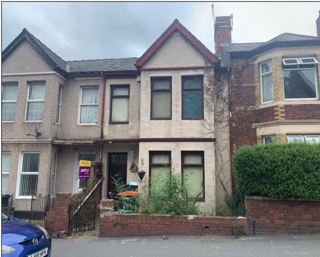
This spacious, mid-terrace, two-bedroom home at 215 Caerleon Road, Newport had a guide price of £99,000 and sold for £145,000 after 95 bids.