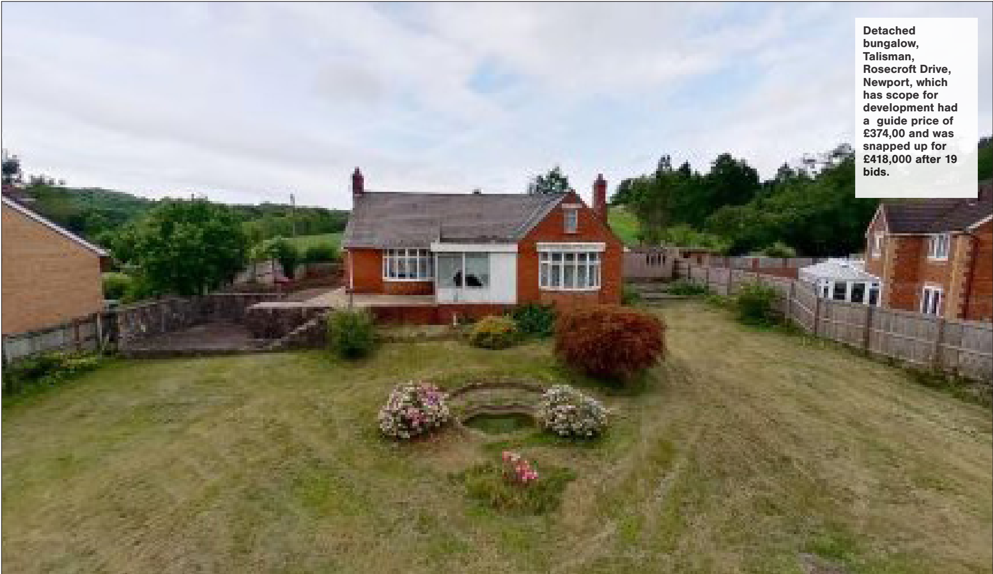
Detached bungalow, Talisman, Rosecroft Drive, Newport, which has scope for development had a guide price of £374,00 and was snapped up for £418,000 after 19 bids.