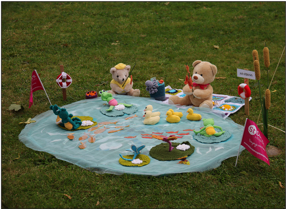
FUN: A fish pond at Caerleon's Magic Garden