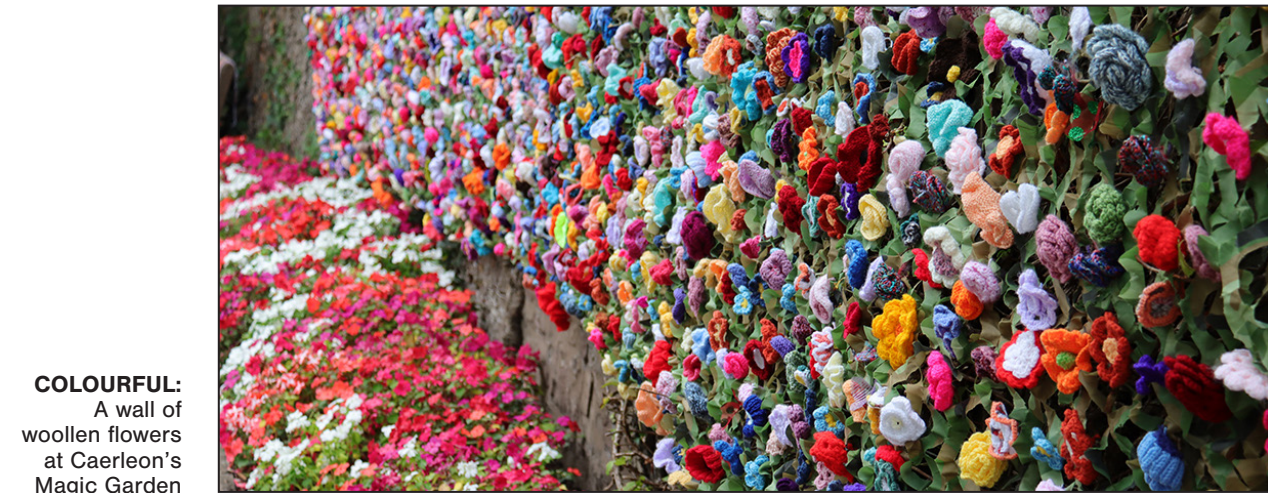
COLOURFUL: A wall of woollen flowers at Caerleon's Magic Garden