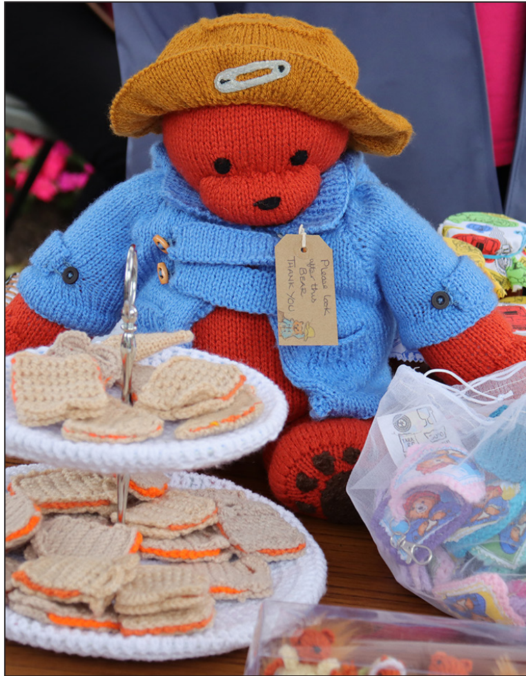
HUNGRY: Paddington Bear with his marmalade sandwiches