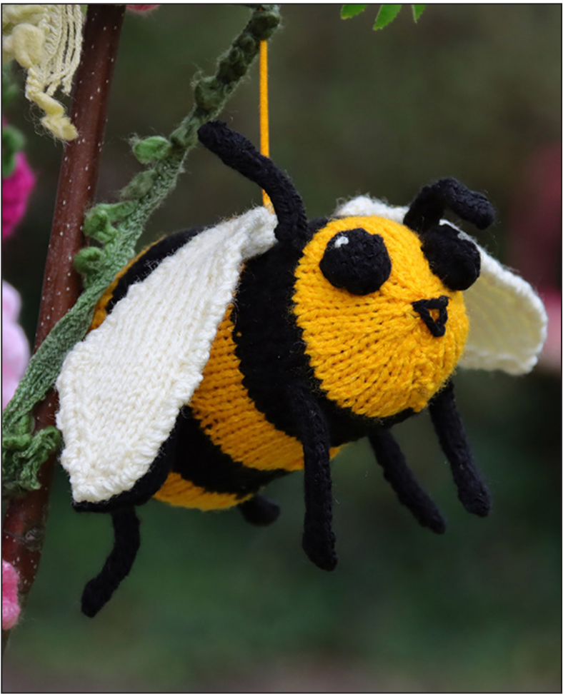
BUZZ: One of the many bees at Caerleon's Magic Garden