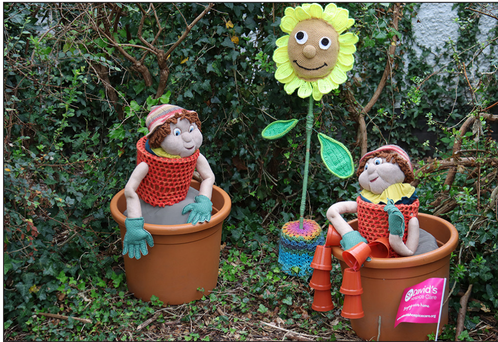
FAVOURITE: Bill and Ben make an appearance at Caerleon's Magic Garden