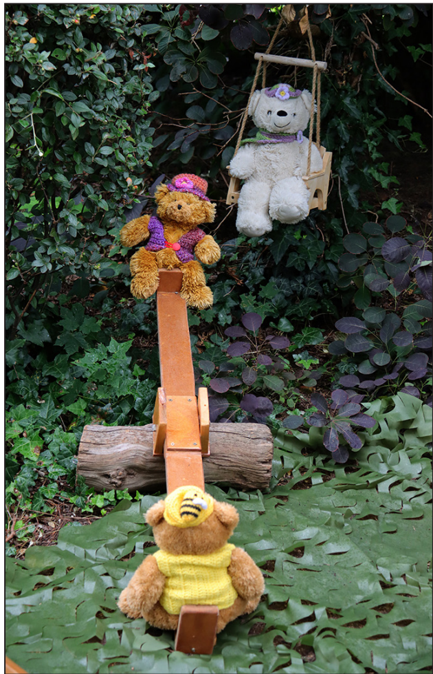
SEESAW: One of the creations at Caerleon's Magic Garden