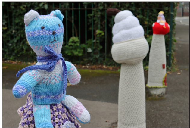
WOOL: Knitted covers decorate the bollards at Caerleon's Magic Garden