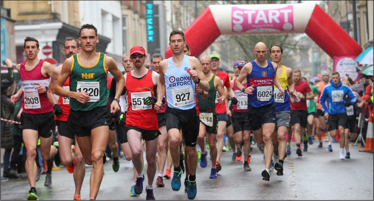
FUNDRAISER: Popular event to go virtual this year due to the pandemic. Our pictures are from previous Newport Half Marathons with runners pounding the streets of the city to raise funds for St David's Hospice Care